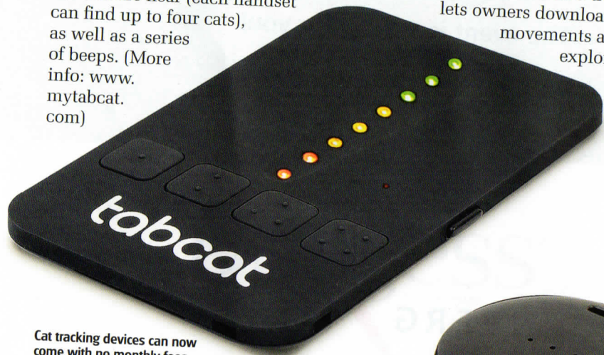
Cat tracking devices can now come with no monthly fees.

Simple to use, the handset displays colour-coded lights that show when the cats are near (each handset can find up to four cats), as well as a series of beeps. (More info: www.mytabcat.com )