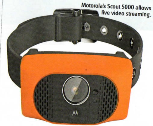
Motorola's Scout 5000 allows live video streaming.

The thrill seekers among your customers will probably already be aware of GoPro's range of 'action cams', and the Fetch™ harness is, unsurprisingly, designed specifically for dogs (suitable for those weighting 7kg to 54kg). Consumers simply mount their GoPro camera (sold separately) either on the back or the chest of their dog's harness and enjoy either 'bone-chewing, digging and front-paw action' (chest mount) or 'over-