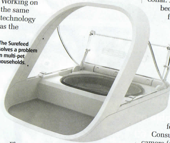
The Surefeed solves a problem in multi-pet households.

SureFlap microchip operated cat flap, the SureFeed consists of a sealed food bowl that only opens when a specific cat's microchip or RFID collar tag (included with the SureFeed) is detected, and shuts again when that cat is out of range. The Surefeed device is designed to make multi-cat owners' lives easier, particularly if they have one cat on a veterinary or weight-management diet, or just one greedy cat that pinches the others' food! It can help with some forms of cat stress. (More info: www.sureflap.com )