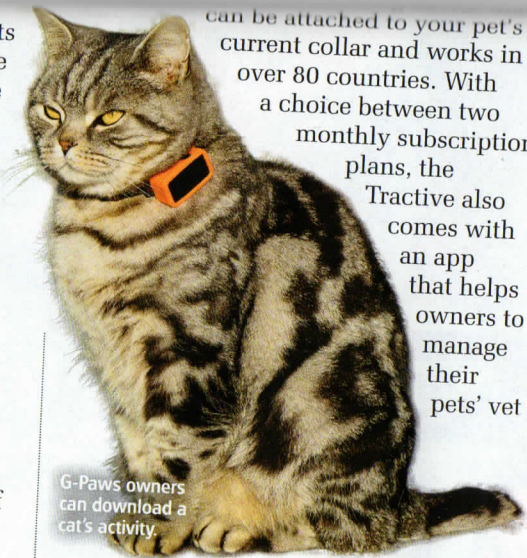
G-Paws owners can download a cat's activity.

can be attached to your pet's current collar and works in over 80 countries. With a choice between two monthly subscription plans, the